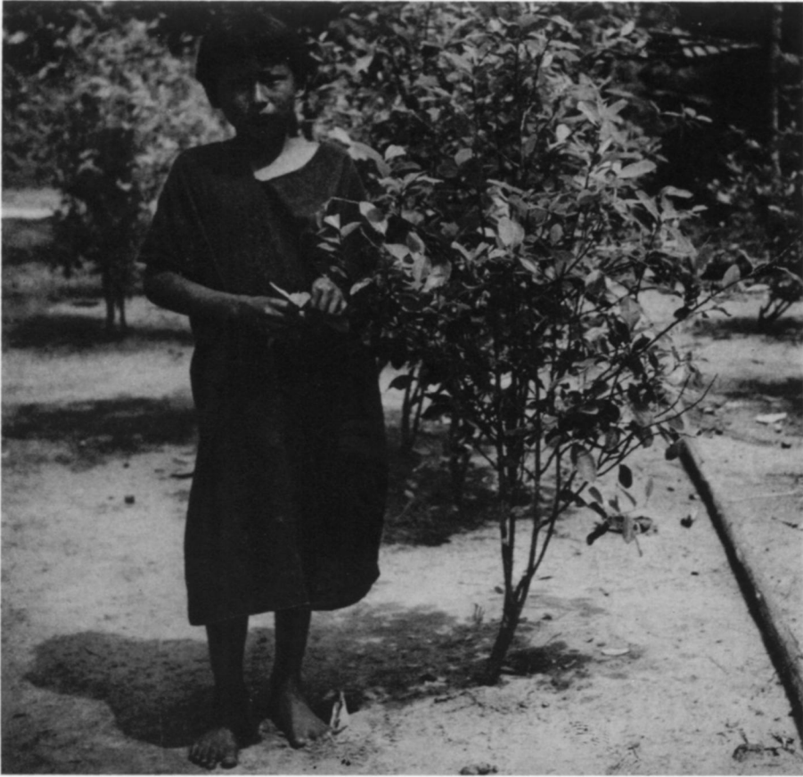
FIG. 1. Koreguaje boy with coca shrub. (Upper Río Caquetá, Colombia.)

covery of cocaine had another less beneficial effect on the reputation of the coca plant; for the occasional abuse of this alkaloid, particularly among persons already addicted to opiates, which was sensationalized by the press both in Europe and the United States at the end of the 19th Century, created the erroneous fear that coca equalled opium in its perniciousness and its deleterious effect on physical and mental health. In the space of 20 or 30 years, coca went from high praise by kings, popes, artists and doctors as the most beneficial stimulant tonic known to man to vigorous condemnation as a dangerous addictive narcotic. The effect of this prejudice and the subsequent legal ban on coca leaves in Europe and the United States was to halt ex-