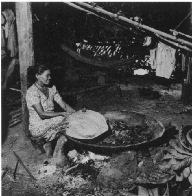
FIG. 5. Kubeo woman preparing powdered coca. (Río Kuduyarí, Vaupés, Colombia.)

of his work party, and they sit together on the ground chewing coca supplied by the owner of the plot. Work commences soon after, but is interrupted after an hour for another coca chew. At noon, another break is taken for a brief lunch of chuño, potatoes, and sometimes cheese, followed by more coca. After working until two o'clock, the party stops for another chew of coca; the work day ends at five o'clock, when the members of the party return home. In arguing against the suppression of coca in Colombia, Henri Lehmann emphasizes the importance of coca to the Indian farmers, particularly since their fields frequently lie far from their homes, and the Indians eat usually only at dawn and at the end of the work day.