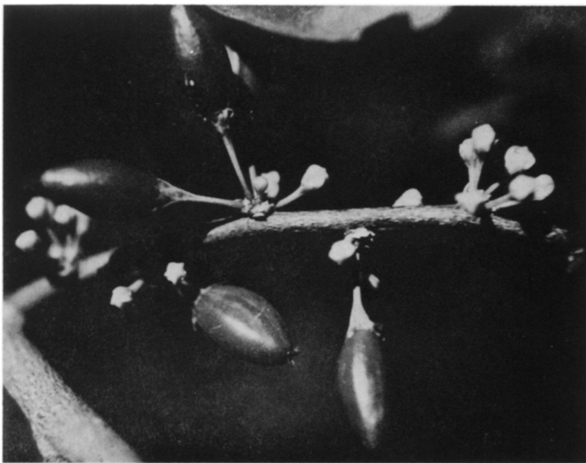
FIG. 2. Fruits and buds of Erythroxylum coca Lam.

phasis on its role in indigenous medicine and religion. Only appreciating the use of coca from the point of view of the Indians' cultural heritage, their beliefs, and the necessities of their daily lives can give a proper perspective on the meaning of coca to these people. In examining the literature on coca, one notices the fact that those authors—scientists and laymen alike—who have spent time living, working and making friends with the Indians have been the most ready to emphasize coca's beneficial effects and lack of serious deleterious effects, which in many cases they corroborated by personal experiences with the drug; on the other hand, the most derogatory and condemning reports have come from travellers like Pöppig, who admitted his distaste for Indian customs, or from officials and doctors who have had little if any experience with Indian life.