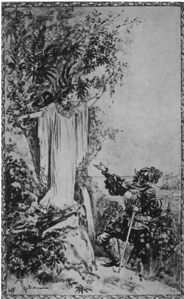
FIG. 7. "Mama Coca Presenting the 'Divine Plant' to the Old World." An aquarelle by Robida. (Frontispiece to Mortimer's History of Coca .)

the latter part of the 19th Century, when doctors in the United States and Europe were more familiar with herbal remedies, coca preparations were extensively used therapeutically for many diverse disorders,